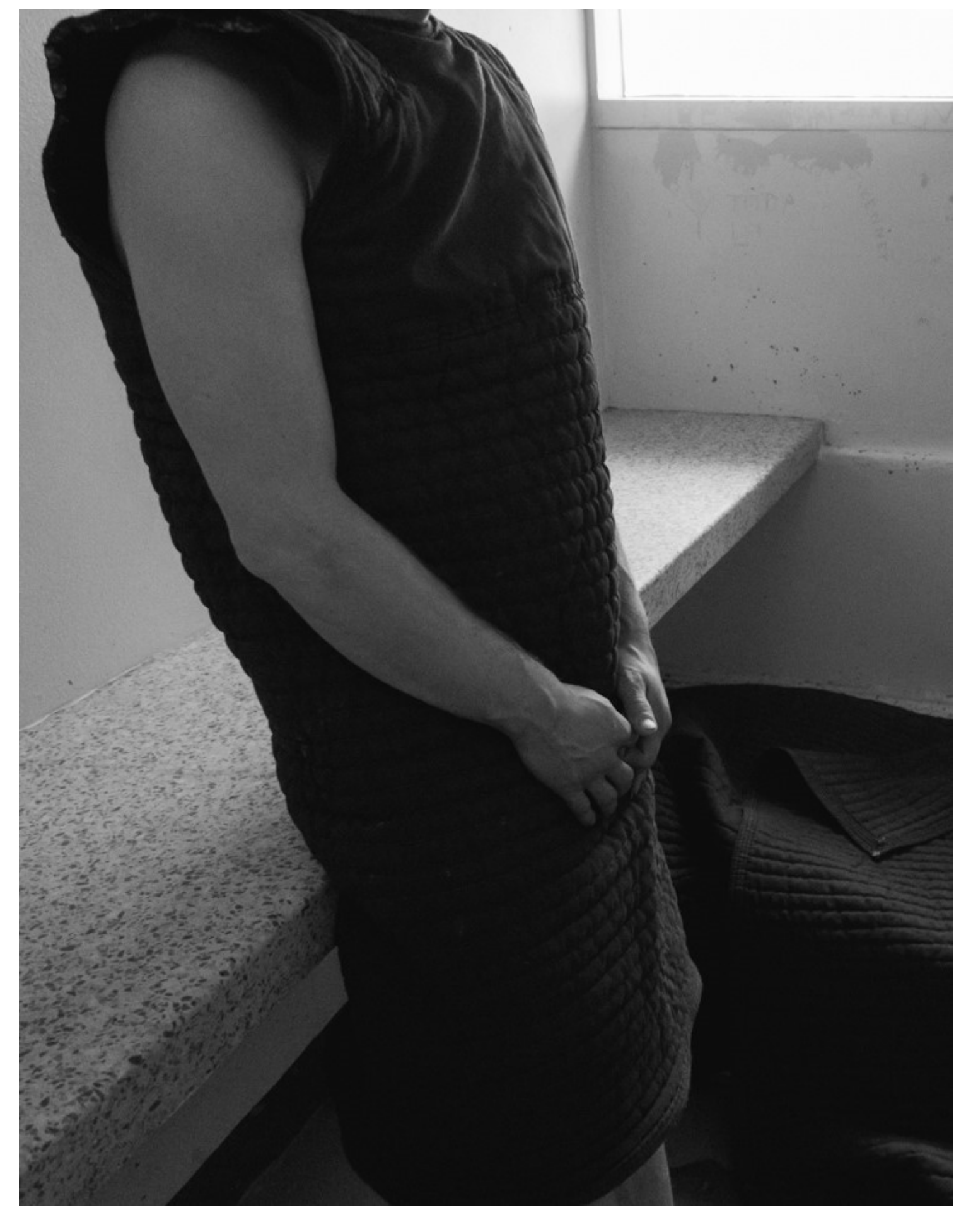
Mental Illness & the Multnomah County Detention Center: One Year after "A Merry Go Round that Never Stops" 23